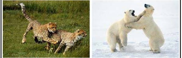
Play behavior: Cheetahs and polar bears