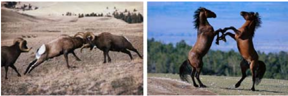
Territoriality: mountain goats and stallions