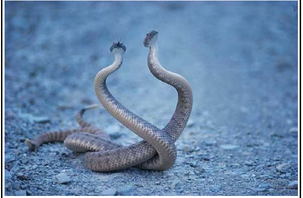
Ritual wrestling by rattlesnakes