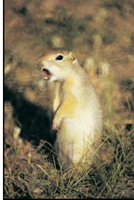
Altruistic behavior in the Belding ground squirrel/ Prairie Dog